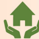
Residential Care Home