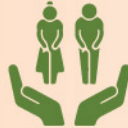
Assisted Living Facility